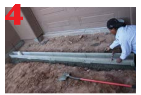
Continue to lay channels to required run length; continuously check alignment and level.