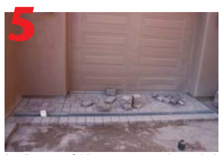
Install pavers or finish pavement surround to required level, should be 1/8" above grate.