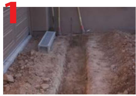
Excavate area to allow room for channels/catch basin and 4" of concrete on all 3 sides.