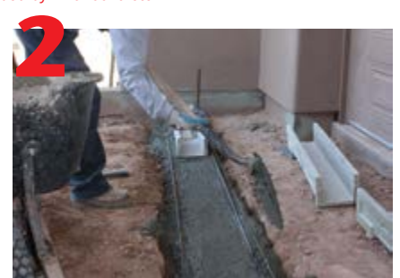
Pour concrete bed - 14" wide by 4" deep, keep outlet pipe clean.