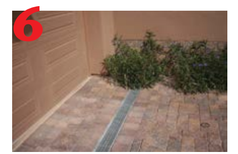
Clean away debris, remove protective plastic if necessary. Seal joints if required.